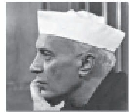
Central Prison, Naini October 26, 1930