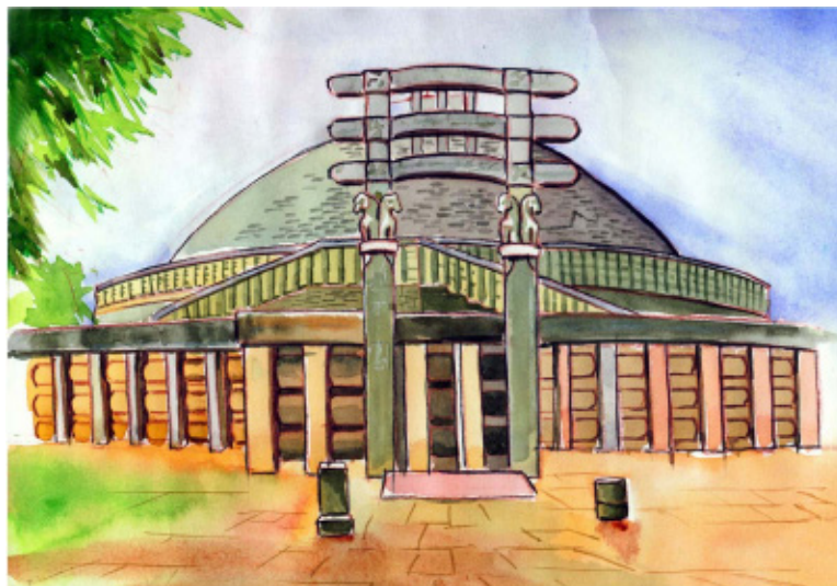
Figure 1.5 Sanchi Stupa

Many great works of literature were produced in ancient India. Rig Veda is the earliest specimen of Indo-European literature. The four Vedas, Sutras, the two Epics-Ramayana and Mahabharata, Smritis, Puranas, Tripitakas, Jaina Agamas and other religious texts are the products of ancient India. Moreover, there are a number of drama, prose and poetic works. Great literacy figures like Kalidasa, Banabhatta, Harisena, Vishakhadatta, Bhasa, Bhairavi, Shudraka and many others belonged to this period. Sanskrit, Pali and Prakrit literature made great progress in ancient India.