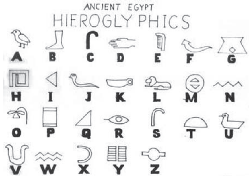
Figure 1.2 Hieroglyphics Script