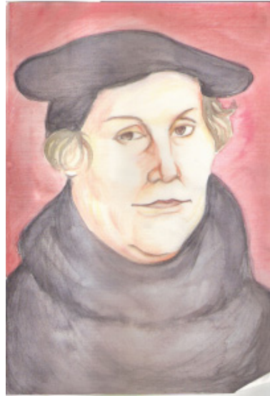
Figure 3.2 Martin Luther

Luther's views started the Protestant Reformation in the West and it divided the Christian world into two, the Protestants and the Roman Catholics. According to him, Christians must win salvation by following Christ and not by buying letter of indulgence. Though the Reform Movement in England was influenced by Lutheran ideas, the English Reformation occurred as a direct result of King Henry VIII's efforts to divorce his first wife, Catherine of Aragon. Thomas Cromwell, the King's Chief Minister, helped the Parliament to pass the Act in Restraint of Appeals and the Act of Supremacy. It gave a royal headship to the King over the church. The king was allowed to marry Anne Boleyn, a commoner.