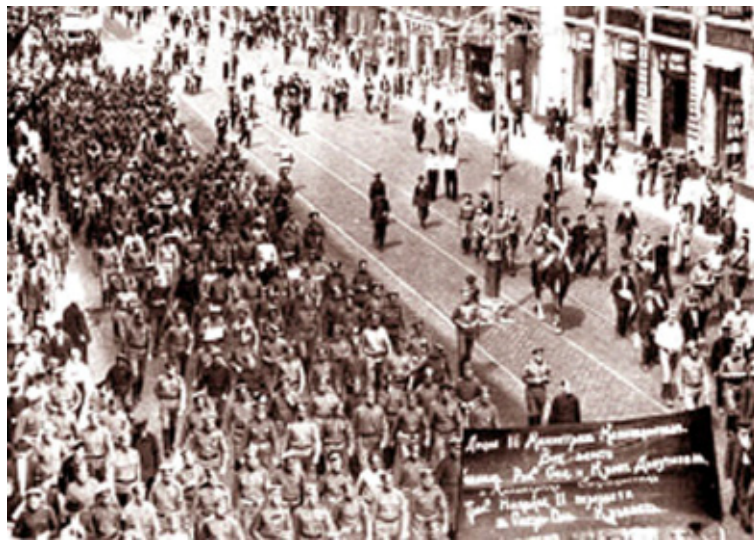
Figure 3.7 Demonstrations by the People on 18 June 1917 at Petrograd. The banner says, “Down with the 10 Capitalist Ministers; All Power to the Soviets of Workers’, Soldiers’, and Peasants’ Deputies; and to the Socialist Ministers, we demand that Nicholas II be transferred to the Peter-Paul Fortress.”

In 1917, occurred another revolution in Russia. It happened because the condition of the Russian workers and peasants, and non Russians living in Russia had become quite miserable under the autocratic rule of Tsar Nicholas II. Exploitation along with inhuman working conditions and huge amount of taxes had made the people rise against him. People were also denied any political rights. Russia had also entered World War I for imperialist gains. But she was unequipped to do so. Thousands of Russian soldiers were killed in World War I as they were ill equipped with no proper warm uniforms and arms to fight in the cold desert of Siberia. Many skilled workers were forced to enlist in the army and fight in the battlefields resulting in their deaths. The nobility were also dissatisfied with Tsar Nicholas II due to his autocratic ways. Famines further worsened the situation in the country. This resulted in labor riots and strikes. Striking crowds attacked courts, prisons and office premises. There was widespread unrest among all sections of society. The army lacked ammunition, the cities lacked food while the peasants failed to get proper return for their produce. The government in the meantime had printed millions of Rouble notes leading to inflation. The situation slipped out of Tsar's hands.