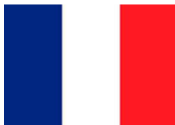
Figure 3.4 Flag of France during the French Revolution

Count the number of stars in the American map. What do you think it represents? Count the number of stars in the present day flag of America.