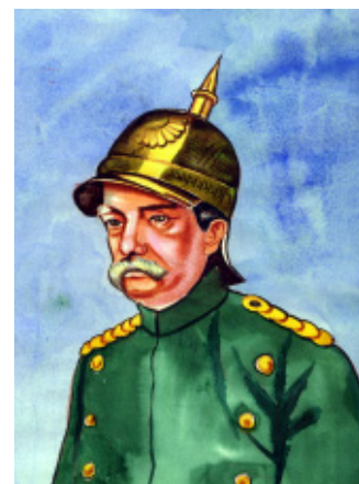
Figure 3.6 Otto Von Bismarck

After Napoleon’s defeat in 1815, many Germans wanted an independent Germany. Germany was a confederation of 39 small states, led by Austria and Prussia. These states were always at war with one another, deterring the economic progress of Germany. The King of Prussia, Kaiser William I, chose a Prime Minister Bismarck to unify Germany under the rule of Prussia, and excluding Austria and France completely. Bismarck was fearless and believed in the urgent need for unification in Germany. He started with the modernisation of the army, defying the parliament in collecting taxes. His policy came to be known as ‘Blood and Iron’ policy and earned him the nickname of the ‘Iron Chancellor’.