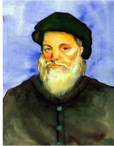
Figure 3.3 Vasco da Gama

Why do you think that these great adventures and voyages were sponsored by kings and wealthy people? The tremendous increase in trade and colonization had a great impact on the enhancement of European wealth. One of the most famous kings who sponsored the voyages was the Portuguese King Henry, who is also known as Henry the Navigator. The technological base for these discoveries came from the invention of the compass, astrolabe, astronomical tables and the art of map making. These voyages led to the establishment of trading outpost and colonial empires in different parts Africa, America and Asia. Now commercial focus shifted from Mediterranean Sea to the Atlantic Ocean. Many new commodities were added to trade such as tobacco, molasses, ostrich feathers, potato, etc. It also started the inhuman slave trade in America. Slaves were captured from Africa, transported across the Atlantic Ocean and sold to work in plantations in North America.