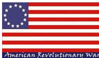
Figure 3.5 Flag of the American War of Independence