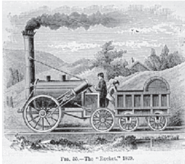
Figure 4.2 George Stephenson's 'Rocket', 1829

raw materials and factory made products to their destinations. In 1814, George Stephenson built the first steam locomotive engine to run on railway tracks. Soon the steam engines and railways were transporting goods over tracks throughout England and supporting the canal transportation.