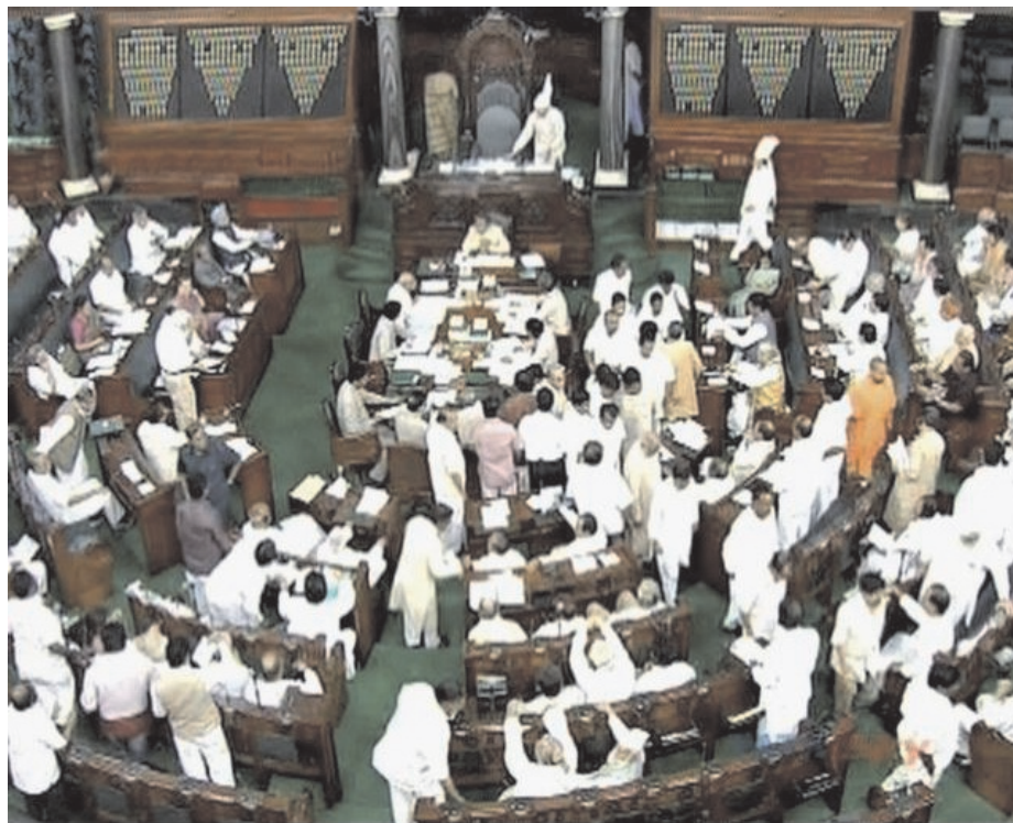
Figure 20.6 Session of Lok Sabha

Lok Sabha is presided over by the Speaker and in his/her absence by the Deputy Speaker. Members of the Lok Sabha elect the Speaker and the Deputy Speaker from among themselves. He/She maintains order and discipline in the lower house as well as supervises its proceedings. He/She decides who will speak and for how long. He/She normally does not cast his/her vote but can vote in case of a tie. The Speaker decides whether a bill is an ordinary or a money bill and his/her decision is final. Besides, he/she is the custodian of the rights and privileges of the members. In case of a joint sitting of the Lok Sabha and the Rajya Sabha, the Speaker of the Lok Sabha, presides over such meetings.