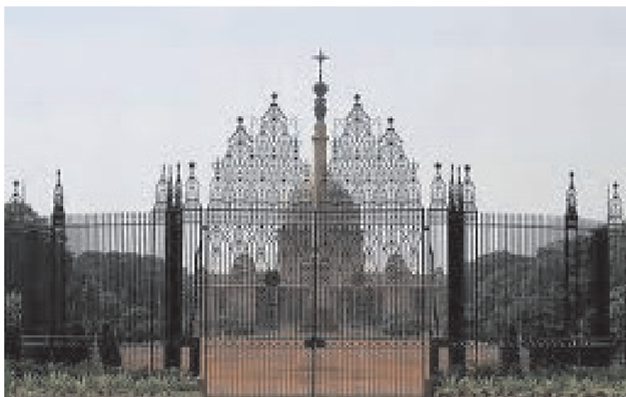
Figure 20.3 Rashtrapati Bhawan