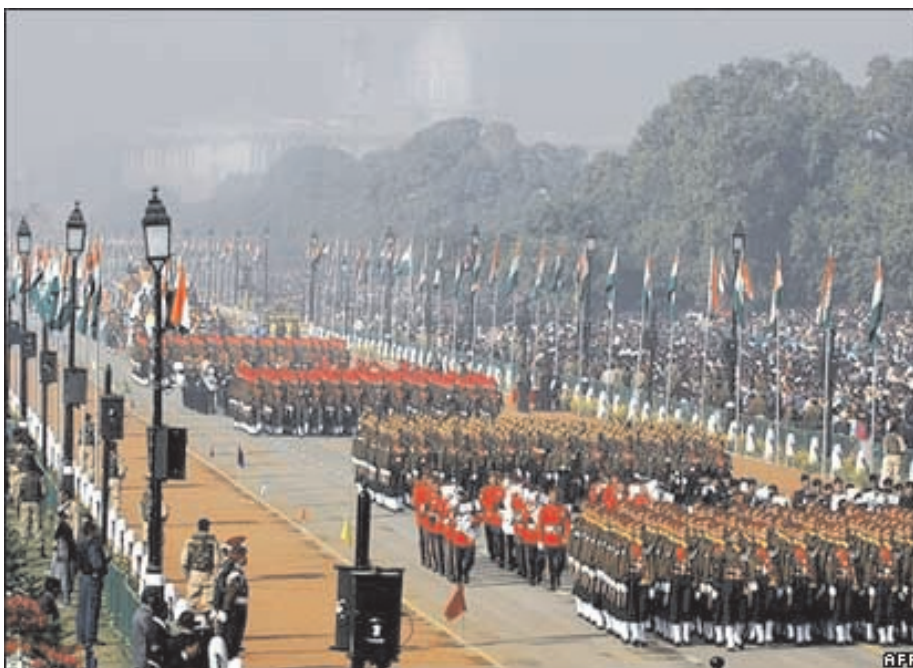
Figure 20.1 Republic Day Parade

The illustration below is showing the Republic Day Parade. We celebrate 26 January as Republic Day every year. India is known as a Republic. Do you know why? It is because our Head of the State, the President of India is elected. It is not so in Great Britain where the Head of State happens to be either the King or the Queen. The office there is hereditary.