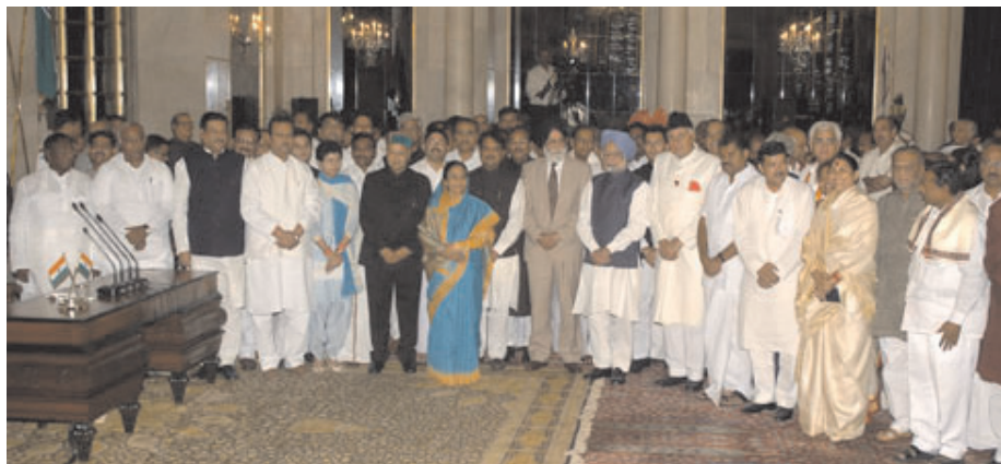
Figure 20.4 Members of the Union Council of Ministers after Taking Oath (2009)