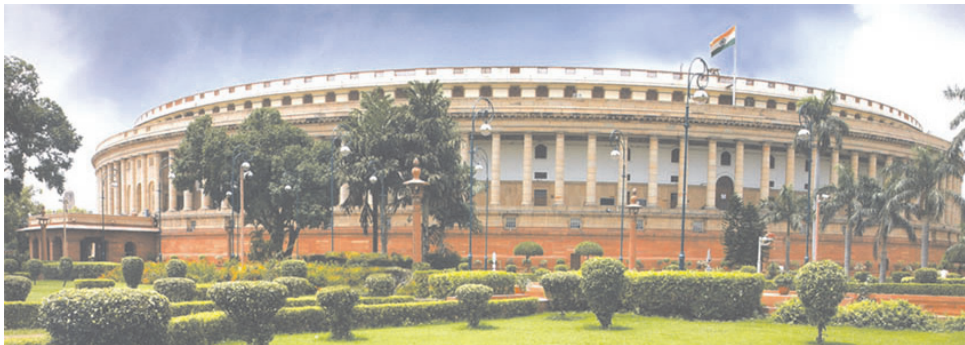
Figure 20.5 Parliament House, India