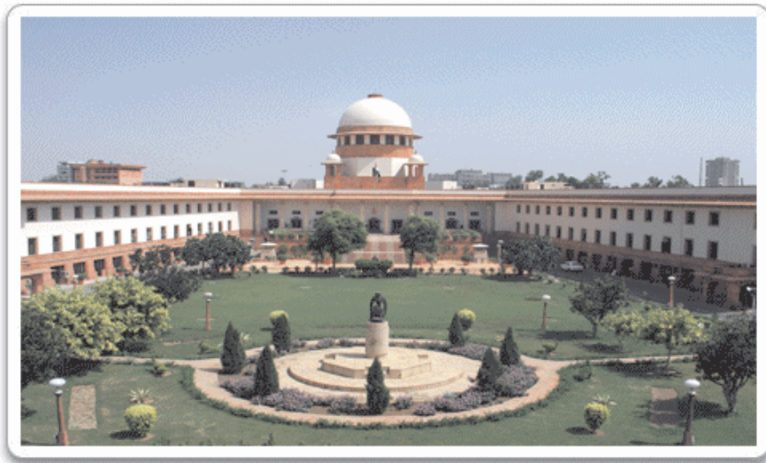
Figure 20.7 The Supreme Court of India

As provided in the Constitution, the Supreme Court of India consists of the Chief Justice and other Judges whose number is prescribed by the Parliament from time to time. In 1950 there was a Chief Justice and there were 7 Judges. But the number of Judges continued increasing as per the need. The Supreme Court, at present, consists of the Chief Justice and 30 Judges.