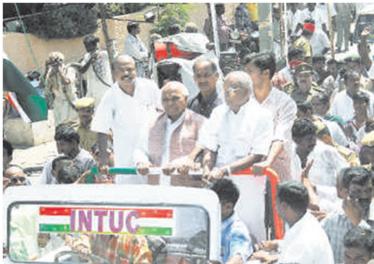
Figure 21.1 A Rally by Indian National Trade Union Congress

You can see below the illustration depicting a rally by the Indian National Trade Union Congress (INTUC). INTUC is an organization that can be described both as a pressure group and an interest group. Generally, interest groups and pressure groups are considered synonyms, but they are actually not. Interest groups are organized groups of people which seek to promote their specific interests. Their characteristics are: (a) they are well-organized, (b) they have certain common interests, (c) the interest that unites the members is specific and particular, (d) the members of such organized groups seek to attain, protect and