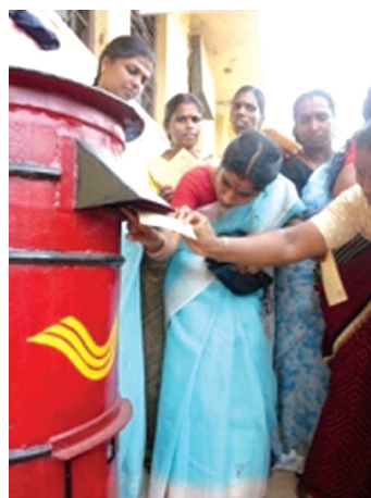
Figure 21.3 Women of Kerala sending postcards to P.M. and President of India in support of demands made by Meira Paibis and Irom Sharmila for peace in Manipur