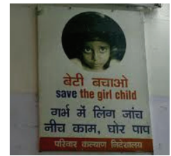
Advertisement on Posters

Posters are printed and posted on walls, buildings, bridges etc to attract the attention of customers. Posters of films which are screened on cinema halls are a common sight in our country.