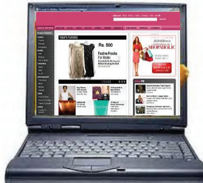
Advertisement on Internet

Are you aware about internet? In fact it is the latest method of communication and gathering information. If you have a computer with an access to internet you can have information from all over the world within a fraction of second. Through internet you can go to the website of any manufacturer or service provider and gather information. Sometimes when you do not have website addresses you take help of search engines or portals. In almost all the search engines or portals different manufactures or service providers advertise their products.