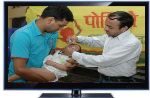
Advertisement of Television