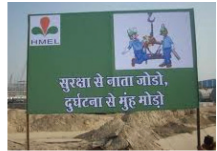
Advertisement on Hoardings

While moving on roads you must have seen large hoardings placed on iron frames or roof tops or walls. These are normally boards on which advertisements are painted or electronically designed so that they are visible during day or night. The advertisers have to pay an amount to the owners of the space, where the hoardings are placed.