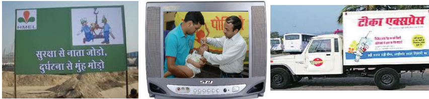
Media used in Advertising

product called “XYZ hair oil”. Then while going to buy hair oil you ask the shopkeeper to show you that product. You like the fragrance and find the price reasonable and purchase it for your use. There can be many such examples of different nature, like a builder selling flats on installment basis, a shopkeeper giving discounts, a new product being launched by a manufacturer, so on and