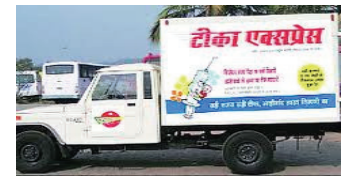
Advertisement on Vehicles

You must have seen advertisements on the public transport like buses, trains, etc. Unlike hoardings these vehicles give mobility to advertisements and cover a large number of people.