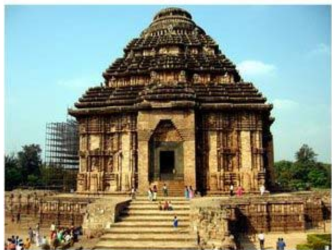
Sun Temple, Konarak, Odisha