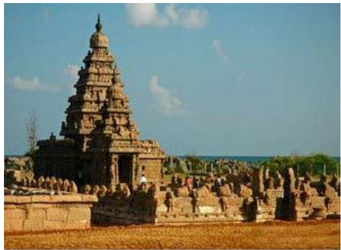
Group of monuments at Mahabalipuram near Chennai

Temple building activity flourished in India from the 5 th century AD onwards. While the North Indian temples were built in the Nagara style consisted of the shikaras (spiral roofs), the garbhagriha (sanctum) and the mandap (pillared hall), the temples in the South were built in the Dravida style completed