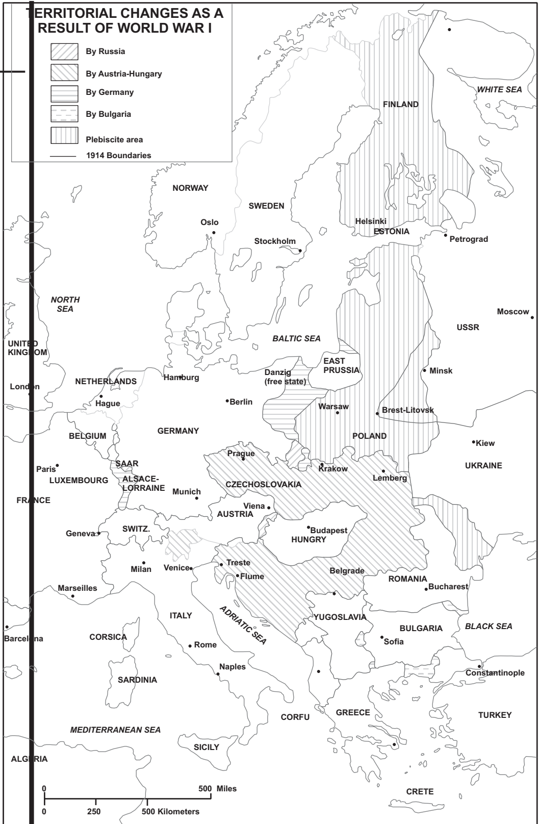
Map 24.1 Territorial Changes as a Result of World War I