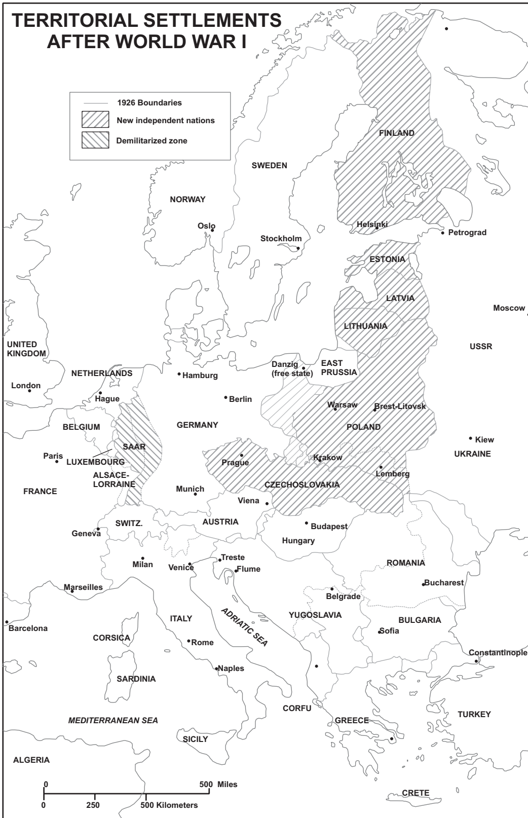
Map 24.2 The Changed map of Europe 2 Block