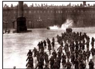
Fig. 28.1.1 Bolshevik Revolution storming of Fort

The twentieth century is often remembered through its landmark events such as the Bolshevik Revolution, the World Wars, Fascism and the liberation of Asian and African nations from colonial rule.