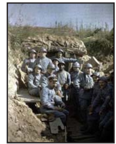
Fig. 28.1.6 Trench in World War I

All these developments were undoubtedly crucial and left their deep imprint on the contemporary world. However, it is important to note that society is transformed not just by dramatic occurrences but also many slow and long term changes in economy and culture and demography. The twentieth century was also a period of numerous such changes some of which were imperceptible to people living through them but which, in the long run, played a major role in giving to the world its present form.