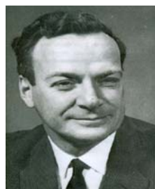
Fig. 28.2.2 Richard P Fyneman