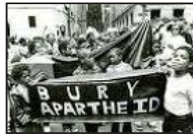
Fig. 28.1.2 African Liberation