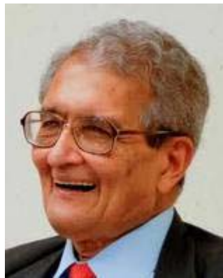
Fig. 28.4.2 Amartya Sen

This does not imply that broader questions about causation, human nature and change are not being posed today. Great thinkers like Bertrand Russell, Noam Chomsky and Louis Althusser continued to write on a broad range of concerns.