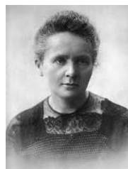
Fig. 28.2.1 Marie Curry, Discovery of Radioactivity

Behind this spate of technological innovations lay very intricate developments in various scientific realms such as sub atomic physics, genetic and molecular biology and space research. Some of the famous scientists who made major discoveries in these fields were Marie Curie, Albert Einstein, Fyneman and Homi J. Bhabha .