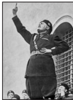
Fig. 28.1.4 Fascism in Italy