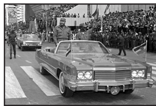
Fig. 28.1.5 Ethiopia Liberation Movement