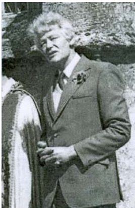
Fig. 28.4.1 E. P. Thompson