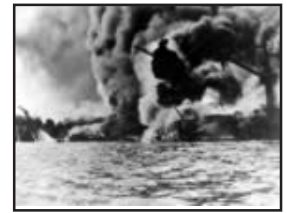
Fig. 28.1.3 Attack on Pearl Harbour world War II