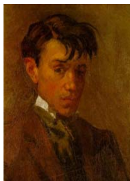
Fig. 28.3 Picasso

Some of the great modernists who evolved their own styles in this vein were the Spanish painter Pablo Picasso famous for introducing ‘cubism’ or multi dimensional view of figures in paintings and the famous Irish writer James Joyce who introduced the technique of ‘the stream of consciousness’ in his work called Ulysses.