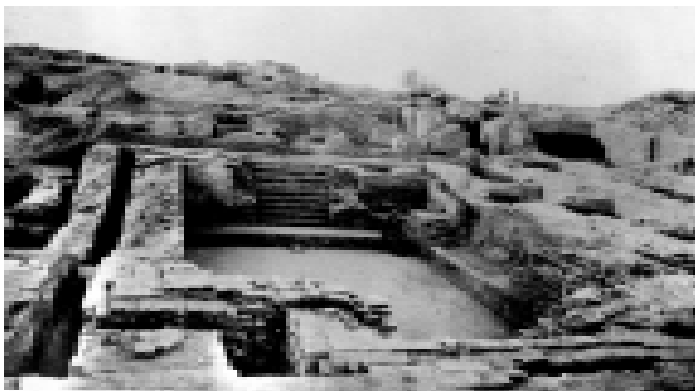
Fig 3.1 Great Bath of Mohenjodaro

The drainage system of the Harappans was elaborate and well laidout. Every house had drains, which opened into the street drains. These drains were covered with manholes bricks or stone slabs (which could be removed for cleaning) were constructed at regular intervals by the side of the streets for cleaning. This shows that the people were well acquainted with the science of sanitation.