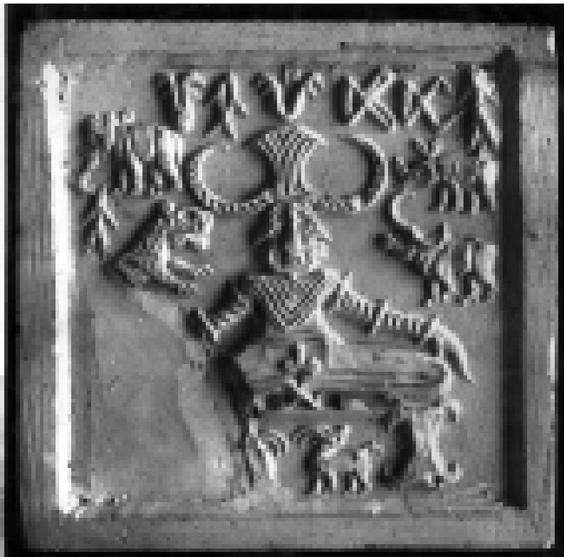
Fig 3.7 Seal of Pashupati

mals there is no representation of horse on these. It has led many scholars to argue that horse was not known to the Harappan people though there are others who do not accept this argument. Besides various kinds of animals, the Harappan seals contain some signs in the Harappan script which however has not been deciphered so far. The most famous of the seals is the one with a horned male deity represented on it. He has three heads and is sitting in a yogic posture surrounded by four animals viz elephant, tiger, rhinoceros and a buffalo. He has been identified by many scholars with the ancient form of the god Pashupati (Lord of beasts) though there are others who dispute this identification.