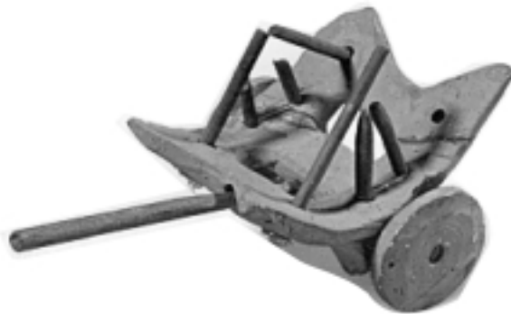
Fig. 3.6 A Terracota cart from Kalibangan

mals there is no representation of horse on these. It has led many scholars to argue that horse was not known to the Harappan people though there are others who do not accept this argument. Besides various kinds of animals, the Harappan seals contain some signs in the Harappan script which however has not been deciphered so far. The most famous of the seals is the one with a horned male deity represented on it. He has three heads and is sitting in a yogic posture surrounded by four animals viz elephant, tiger, rhinoceros and a buffalo. He has been identified by many scholars with the ancient form of the god Pashupati (Lord of beasts) though there are others who dispute this identification.