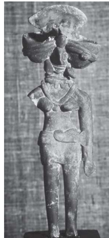
Fig 3.9 Mother Goddess from Mohenjodero

The burial practices and the rituals related with them have been a very important aspect of religion in any culture. However, in this context Harappan sites have not yielded any monument such as the Pyramids of Egypt or the Royal cemetery at Ur in Mesopotamia. Dead bodies were generally rested in north-south direction with their head