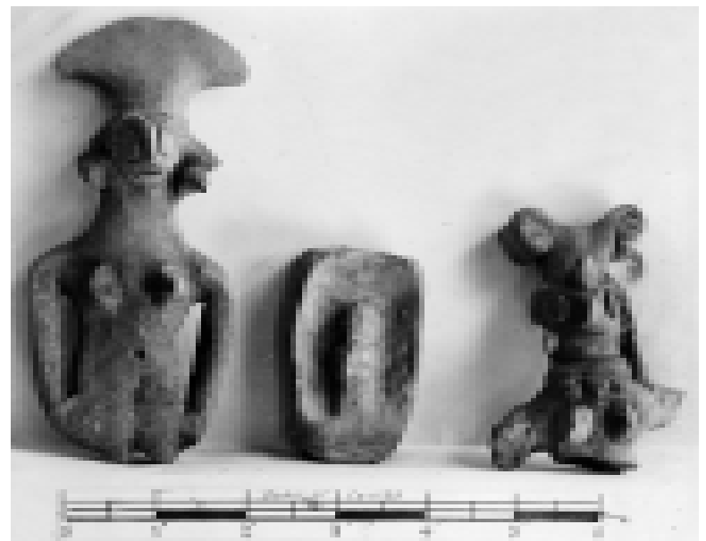
Fig. 3.5 Terracota Human & Animal figurines