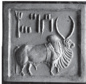
Fig. 3.10 Humped bull seals from Mohenjodero

towards north and the feet towards south. The dead were buried with a varying number of earthen pots. In some graves the dead were buried along with goods such as bangles, beads, copper mirrors. This may indicate that the Harappans believed in life after death. At Lothal three joint or double burials with male and female bodies together were discovered. Kalibangan has yielded evidence of a symbolic burial along