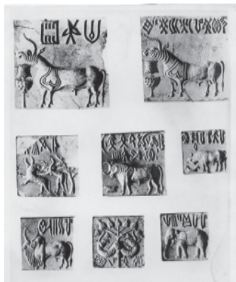
Fig 3.8 Symbolic Pipal Tree from Mohenjodero