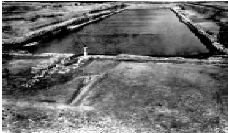
Fig 3.2 The dockyard of Lothal

At Lothal, a brick structure has been identified as a dockyard meant for berthing ships and handling cargo. (Fig 3.2) This suggests that Lothal was an important port and trading centre of the Harappan people.