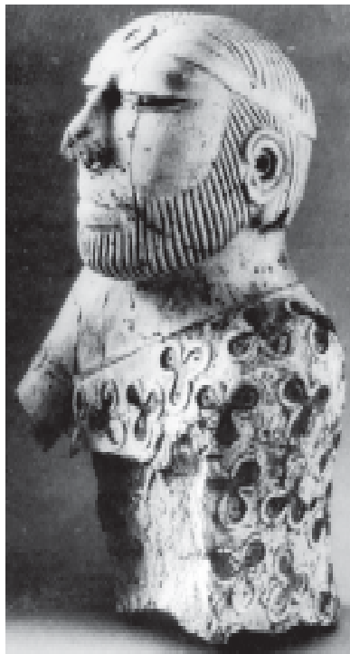
Fig 3.4 Stone Sculpture of bearded man

The Harappans manufactured seals of various kinds. More than two thousand seals have been discovered from different sites. These were generally square in shape and were made of steatite. It is noteworthy that while the seals depict a number of ani-