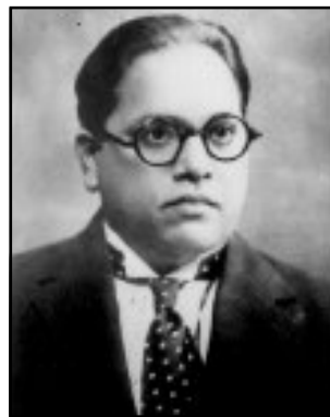
Dr. B.R. Ambedkar, Chairman of drafting committee of constitution

The leaders of the Constituent Assembly were conscious that the need of the hour was general agreement on different issues and principles. As a result, deliberate efforts were made to achieve consensus. While arriving at any decision, the aspirations of the people were uppermost in the minds of the members of the Assembly.