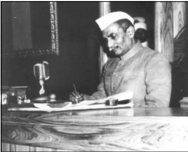
Dr. Rajendra Prasad signing the new constitution

The Constitution of independent India was framed in the background of about 200 years of colonial rule, a mass-based freedom struggle, the national movement, partition of the country and spread of communal violence. Therefore, the framers of the Constitution were concerned about the aspirations of the people, integrity and unity of the country and establishment of a democratic society. Amongst the members there were some who held different ideological views. There were others who were inclined to socialist principles, still others holding Gandhian thinking but nothing could act as any kind of impediment in the progress of the Assembly's work because all these members were of liberal ideas. Their main aim was to give India a 'Constitution' which will fulfill the cherished ideas and ideals of the people of this country.