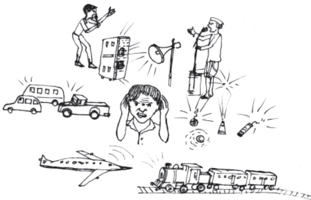
Fig. 11.10: Noise pollution