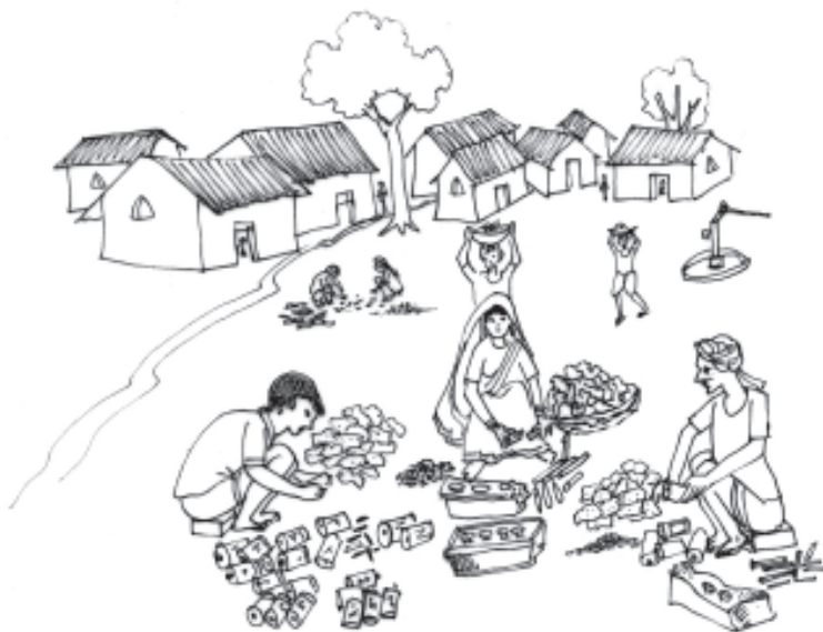
Fig. 11.8: Lead pollution – recovering lead from old batteries

Lead enters the atmosphere from automobile exhaust. Tetraethyl lead (TEL) was added to petrol as an anti-knock agent for smooth running of automobile engines. TEL has now been replaced by other anti-knock compounds to prevent emission of lead by automobiles. Lead in petrol is being phased out by introduction of lead free petrol. Many industrial processes use lead and it is often released as a pollutant. Battery scrap also contain lead. It can get mixed up with water and food and create cumulative poisoning. It can cause irreversible behavioural disturbances, neurological damage and other developmental problems in young children and babies. It is a carcinogen of the lungs and kidneys.