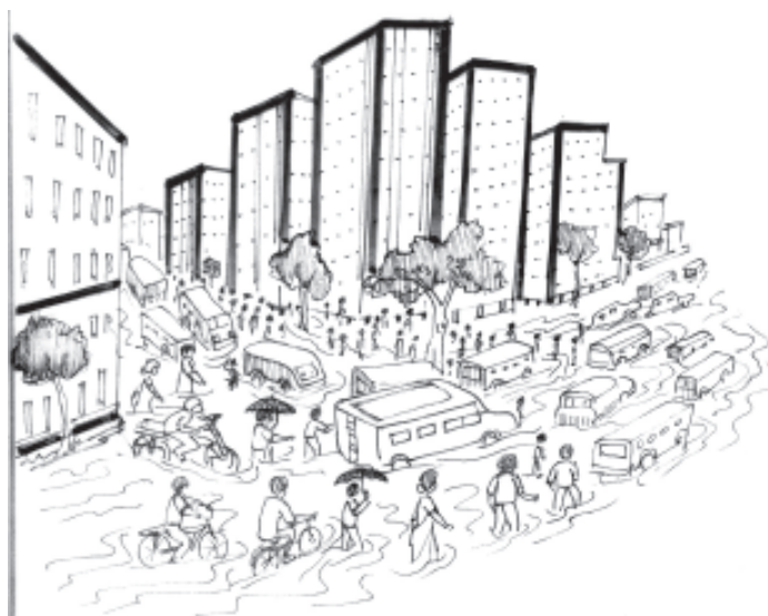
Figure 11.5: Traffic congestion in cities during rainy season

High level of suspended particulate matter is one of the major pollutants in urban areas. This is caused by multifarious human activities such as movement of traffic, smoke from industries and diesel vehicles from automobiles gases like oxides of sulphur, oxides of nitrogen, hydrocarbons, carbon monoxide and carbon dioxide. In addition many trace metals such as iron, zinc and magnesium are found associated with suspended air particulates.