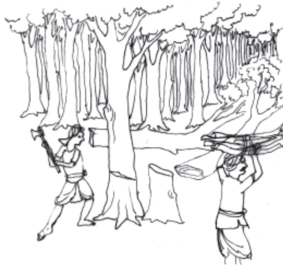
Fig. 11.9: People cutting trees and carrying logs

Workers who are exposed to heavy physical work loads are miners, lumberjacks, construction workers, farmers, fishermen, storage workers and healthcare personnel. Repetitive tasks and static muscular load can lead to injuries and musculoskeletal disorders and may result in short-term and permanent work disability. Unshielded machinery, unsafe structures and dangerous tools are some of the most prevalent work place hazards.