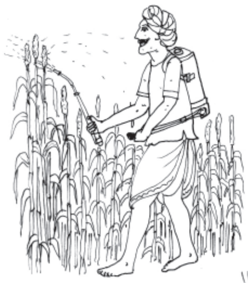
Figure 11.7: Spraying of defoliators and fall out of spray on people

Pesticides: Excessive use of pesticides particularly herbicides like 2,4-dichlorophenoxyacetic acid (2,4-D) has been associated with a 200-800% increase of NHL (Non-Hodgkin's Lymphoma) – one type of cancer in Sweden. Pesticides such as toxaphene, hexachlorocyclohexane (BHC), trichlorophenol, dieldrin, DDT are known to cause lymphatic cancer in rats and mice. The danger is increased due to the persistent nature of the residues of these pesticides in the environment resulting in chronic exposure to low levels of pesticides. The use of all these pesticides has now either been banned or restricted. Organic farming and emphasis on Integrated Pest Management (IPM) as an alternate and environment friendly method of pest control. Asbestos, nickel, cadmium, radon, vinyl chloride, benzidine and benzene are well known carcinogens. Reduction in exposure to these will reduce the incidence of various types of cancer.