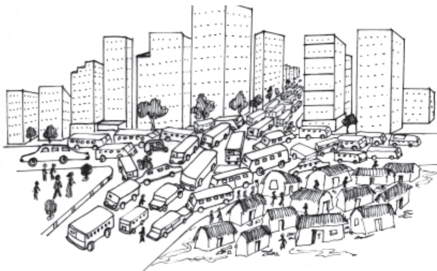
Fig. 11.1: Frequent traffic chaos in a city

In most of the cities there is lack of proper drainage. As a result accumulation of waste water form puddles of dirty water. Animals like cattle, dogs and pigs roam freely in cities and their excreta etc. make sanitation problems worse. Roads are not proper and the different types of transport further pollute the environment and cause health problems.