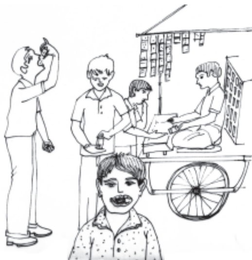
Figure 11.6: People eating tobacco/ snuff and showing cancer of mouth

Smoking tobacco or being regularly exposed to tobacco smoke are responsible for about 85% of all cancer deaths. Smoking may increase the chances of getting cancers of stomach, liver, prostate, colon and rectum. Use of smokeless tobacco, chewing tobacco and snuff cause cancer of mouth and throat. Exposure to environmental tobacco smoke, termed passive smoking also increases the risk of lung cancer for non-smokers. The risk of cancer begins to decrease soon after quitting smoking and chewing tobacco. This risk continues to decline gradually after quitting.