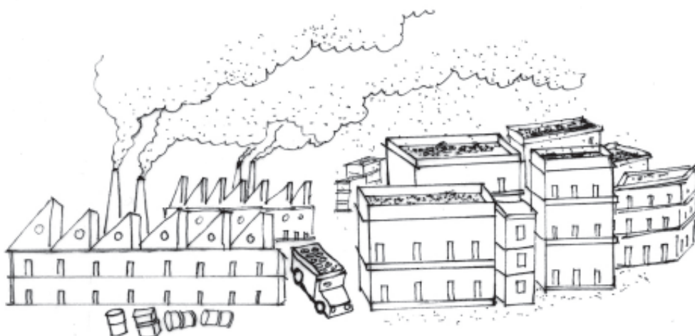
Fig. 11.4: Factory chimney emitting thick cloud of smoke and settling of fly ash