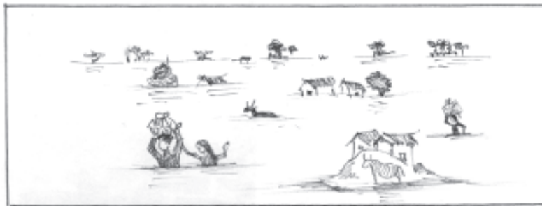
Fig. 12.1: Flood