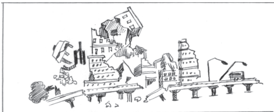
Fig. 12.2: Earthquake

Earthquake is a sudden release of energy accumulated in deformed rocks of earth crust causing the ground to tremble or shake. Earthquake can occur suddenly any time of the year without any warning causing severe loss of life and property (Fig. 12.2). We are aware of the severe damage caused by earthquakes of Latur (1993) and Bhuj (2002).