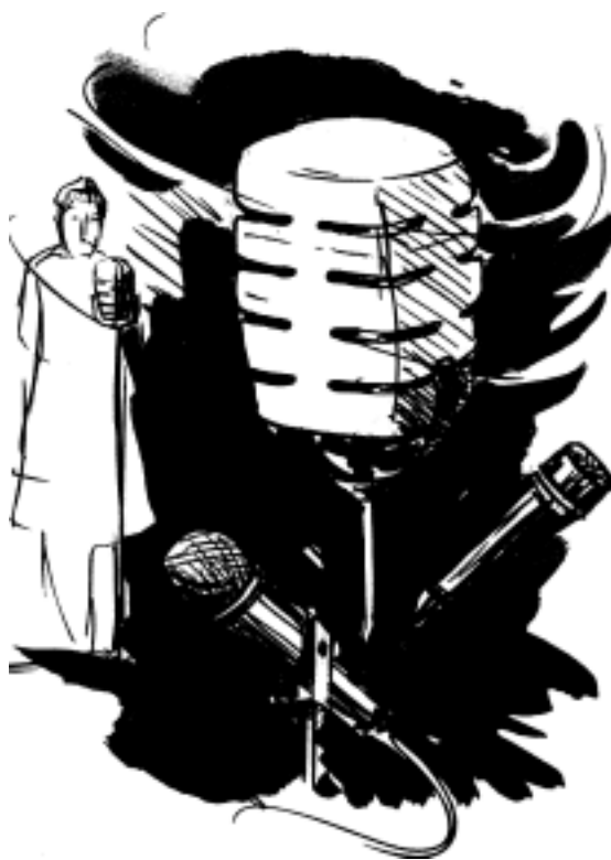
Fig. 12.1: Microphones

There are many other types of microphones which come in different sizes and lengths. If you watch television programmes, you may find a small microphone clipped on the collar. This is called a lapel microphone which is actually a uni-directional microphone. These microphones are not normally used in radio. Then there are long microphones called gun microphones used in sports production. These microphones are often omni directional ones. There are also cordless microphones . You might have seen them being used in stage shows. They do not have any cables or wires attached to them. They have a small transmitter in them which can send the sounds to an amplifier.