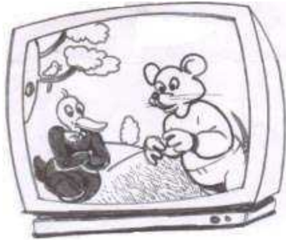
Fig. 15.4: Cartoon channel

Cartoon Network has also aired a few Indian-made cartoons, featuring ‘ Akbar and Birbal ’, ‘ Tenali Raman ’, ‘ Sindbad ’, ‘ Ramayan ’, ‘ Mahabharata ’ and ‘ Vikram and Betal ’.