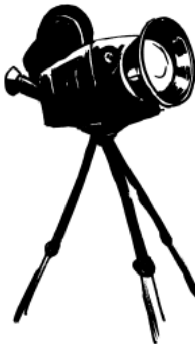
Fig. 16.4: Camera

If you carefully look at any camera, you will see a lens in it. This lens selects a part of the visible environment and produces a small optical image. The camera is principally designed to convert the optical image, as projected by the lens, into an electrical signal, often called the video signal.