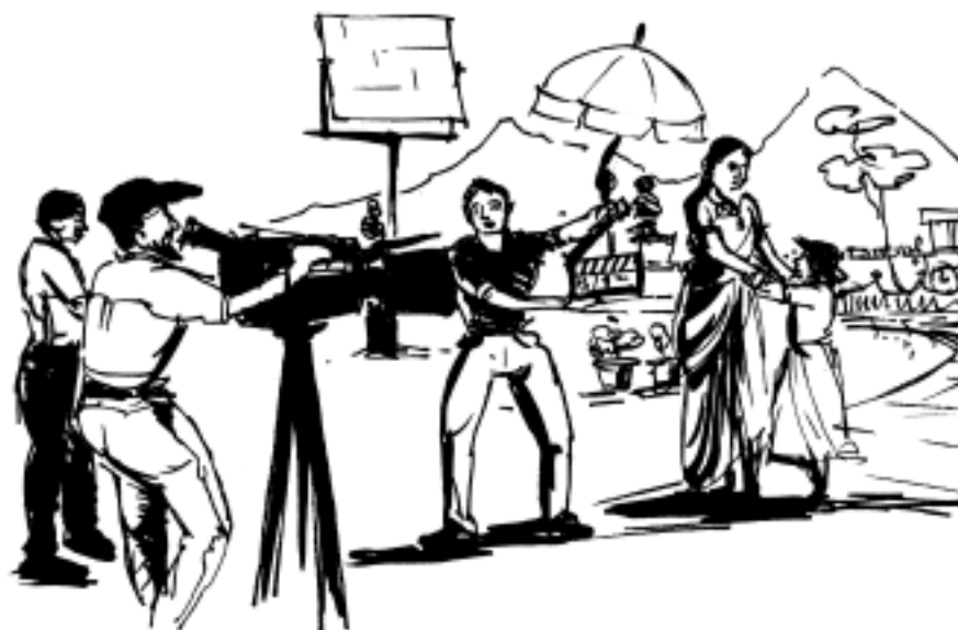
Fig. 16.10 : (b) Outdoor recording