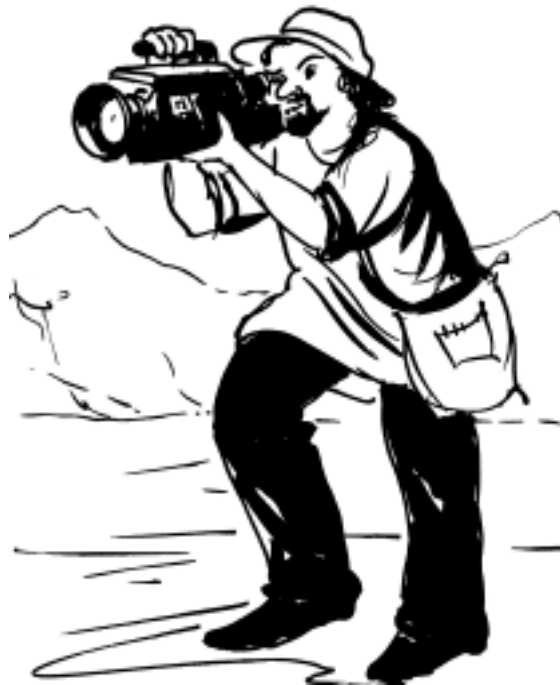
Fig. 16.9 (b) : Cameraperson