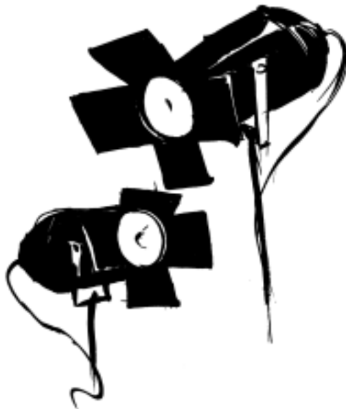
Fig. 16.5: Lights