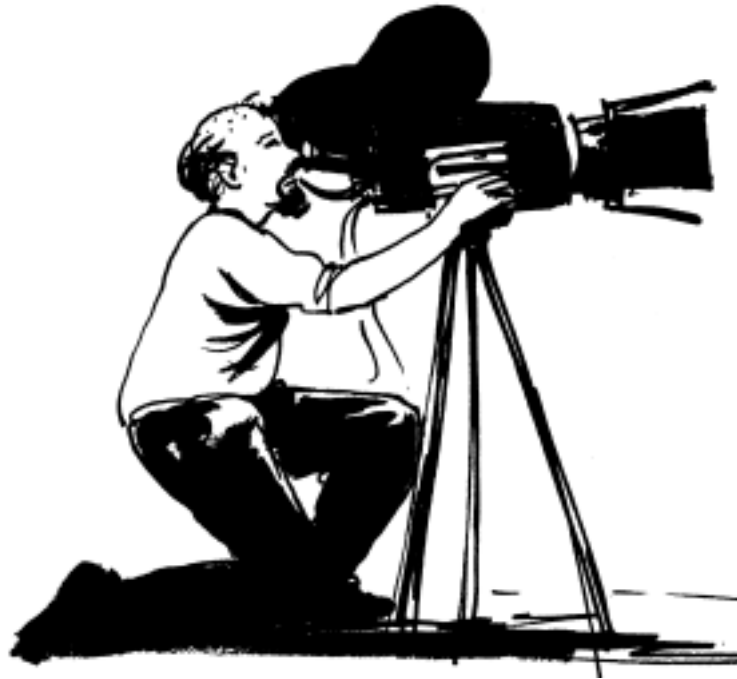
Fig. 16.9 (a) : Cameraperson