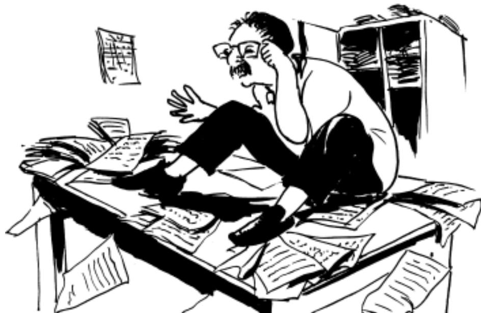
Fig. 16.3: Pre-production stage – getting ideas clear

In it involves planning everything in advance. This is very essential to get desired results. If you have all the raw ingredients ready in your kitchen, you can easily cook the food. Similarly, if you have worked well in this stage of programme production, the other two stages become easy and workable.