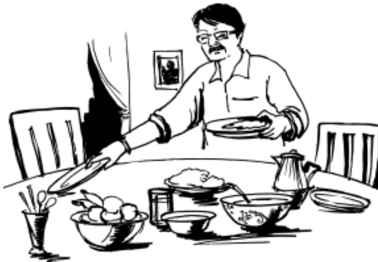
Fig. 16.1 (c)

Now imagine you have to produce a television programme. In a similar manner as above, you will first arrange everything required for the programme production. In the second stage you will actually carry on the production process, and thirdly you will polish the product for the final presentation on television. Thus, we can divide the entire production process into three major stages.