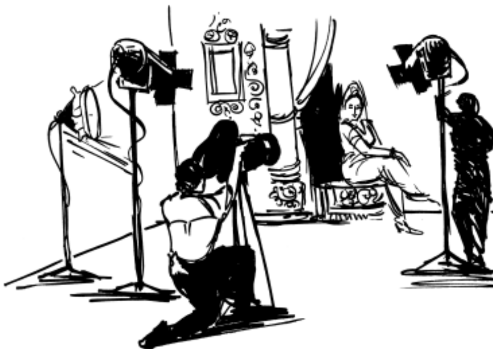
Fig. 16.10 : (a) Studio recording