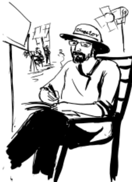
Fig. 16.7: Director

Who is a Director? In a television production, the Director is in-charge of directing the actors and technical operations. The Director is ultimately responsible for transforming a script into effective audio and video messages. Where the camera will be placed, what type of visuals need to be taken, where the actors will stand, all these are controlled by the director.