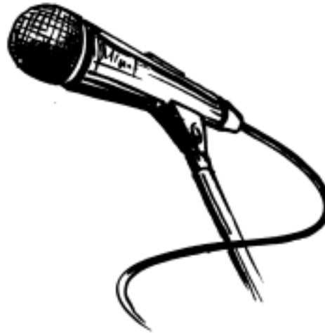
Fig. 16.6: Microphone

There are different types of microphones available for different purposes. Picking up a news anchor's voice, capturing the sounds of a tennis match, and recording a rock concert - all these require different types of microphones or a set of microphones.