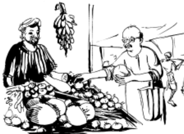
Fig. 16.1 (a)

So you have seen that there were three stages in the making of various food items. In stage one, you arranged for everything required for preparing the food items. In stage two, you actually prepared the food items and in the third stage, you presented them on the dining table.