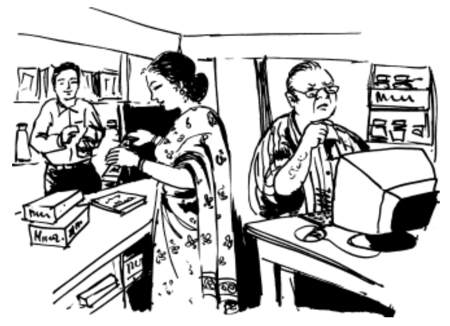
Fig. 22.1: A customer is looking at a web page and trying to identify an item for buying. He has a very puzzled look. There is another customer who is buying things from a shop. She has a satisfied look on her face.

This was also a learning phase for Indian media practitioners and managers. They realized that if they ventured into new media, they had to think of innovative revenue models. They also accepted that they had to sell content to make money. Otherwise, merely getting into business transactions wasn't helping them at all.