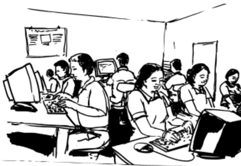
Fig. 23.1: Working in a computer lab

Another problem is that collecting information does not necessarily lead to logical and analytical powers. Many teachers complain that young readers today have a lot of information but they often fail to use it to discuss something.. That’s because raw information without any analysis does not add to your knowledge unless you know how to use it when it’s required.