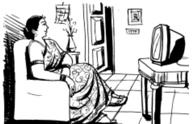
(b) Watching television