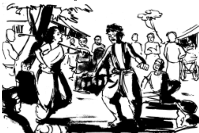
Fig. 25.3 : (a) Street Theatre performance