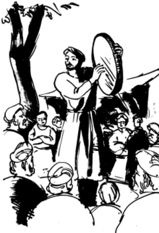
Fig. 25.1 (a) : Announcement

It will be interesting to note that in some forms of traditional media, all the above can be used. For example 'Ramleela' which is a folk play telling the story of Lord Rama in a traditional style is popular in north India and uses all the above traditional mediums.