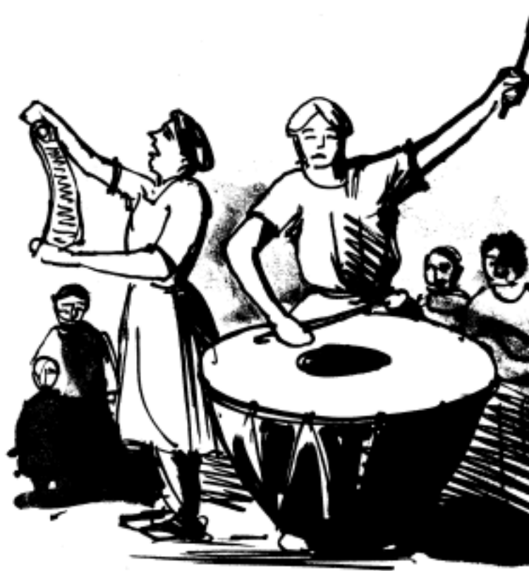
Fig. 25.1 (b) : Nagada