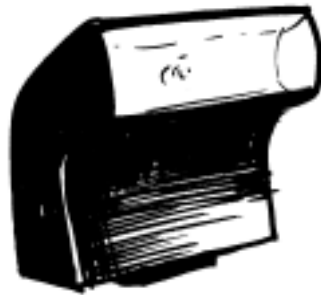
Fig 26.3: (a) Flash