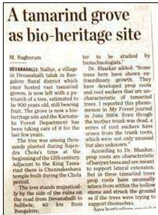
Fig 6.7: Odd Story