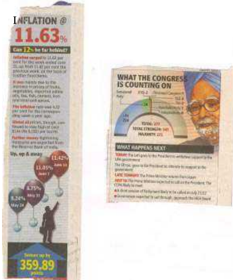
Fig. 7.11: Graphs

Another important decision an editor has to take is about giving a byline or credit to the story. Stories come from news agencies like Press Trust of India, United News of India, PTI Bhasha, Univartha etc. Normally bylines are not given for such stories. But if a reporter files an exclusive story then it should appear with his byline or name so that he gets individual credit for the story. The decision of giving a byline to a reporter for a particular story is taken by the news editor. But a sub editor who edits the story can always suggest to the news editor about giving that story a byline.