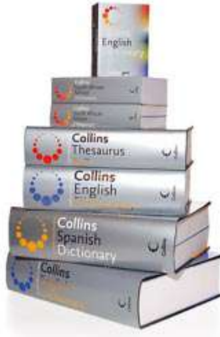
Fig. 7.12: Dictionaries

A good dictionary is the first tool that a sub editor should keep by his side. While subbing or editing a story, you have to refer to it whenever required. All newspaper offices are equipped with different types of dictionaries.