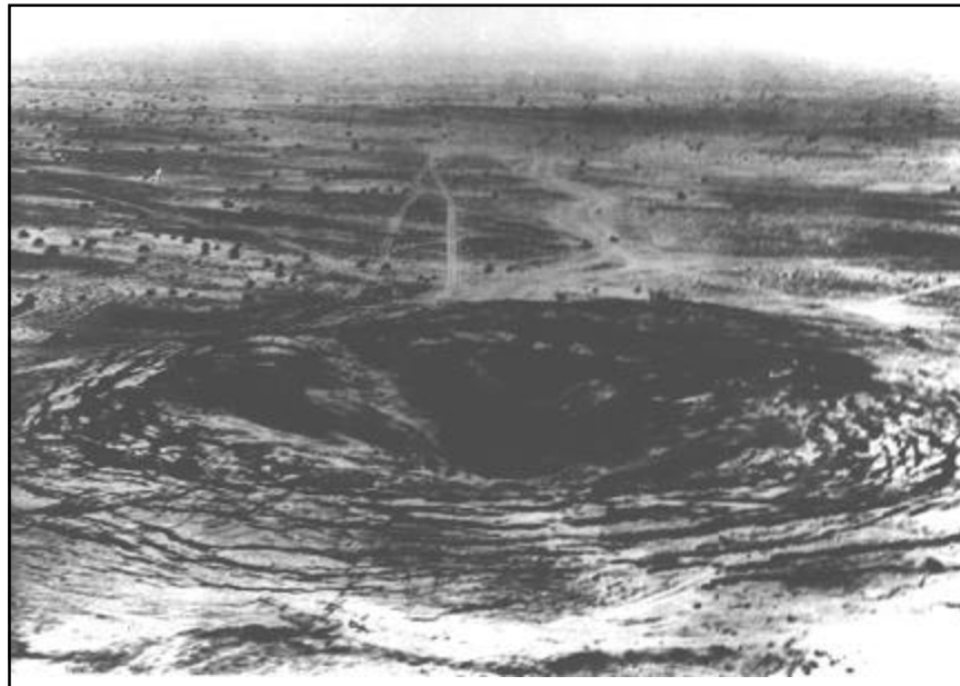
Fig.7.1: Pokhran nuclear site

The copy of the report has been improved by the editor and is therefore easier to read and understand.