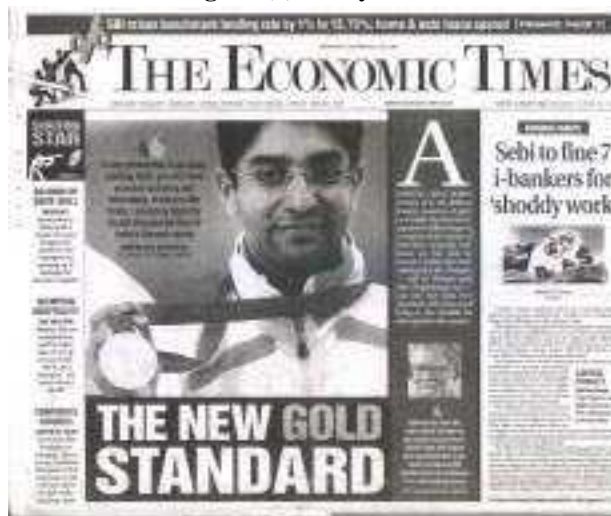
Fig.7.9(b): Story edited

The next job of the sub editor is to value add the report. If some background material has to be added, he has to collect it from the library and improve the