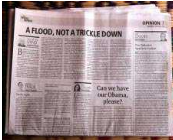
(b) Editorial page