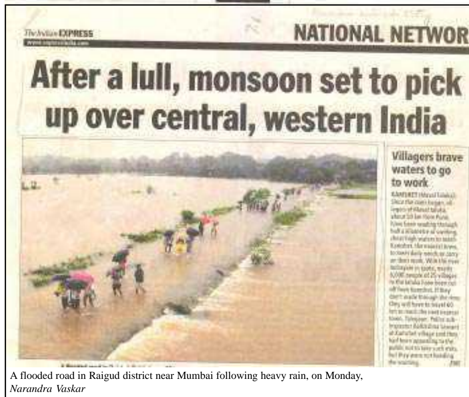
A flooded road in Raigud district near Mumbai following heavy rain, on Monday, Narandra Vaskar