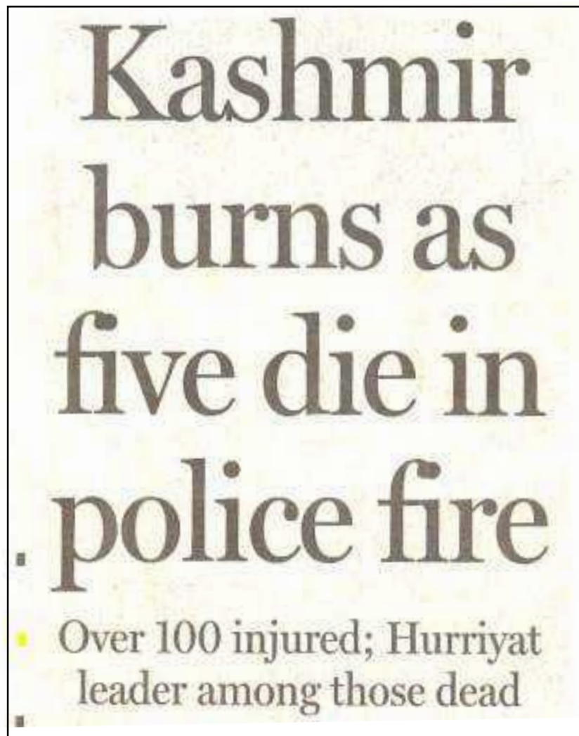
Fig.7.2: Hard news