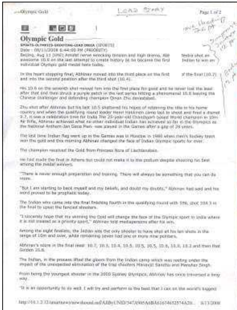
Fig. 7.9(a): Story unedited