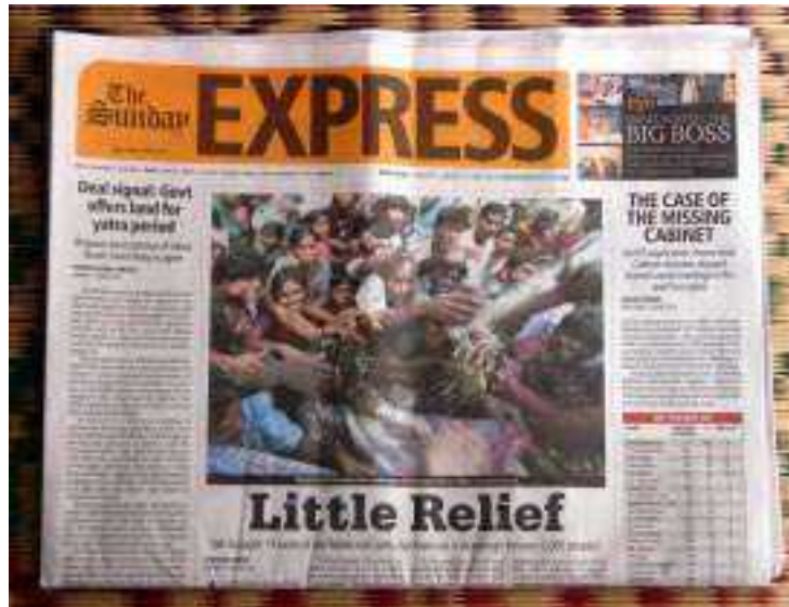
(a) Front page