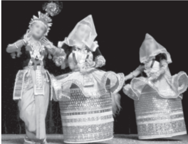
Figure 11.9 Manipuri dance