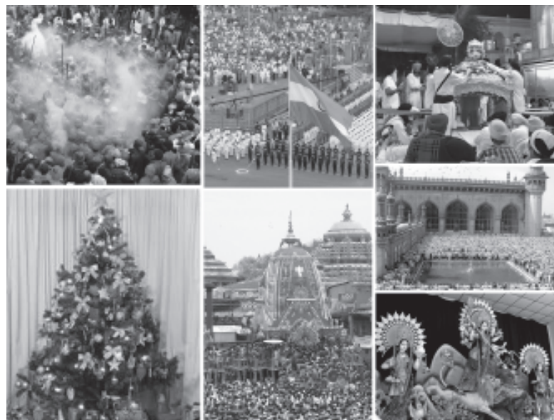
Figure 11.1 Festivals of India as Tourist attractions