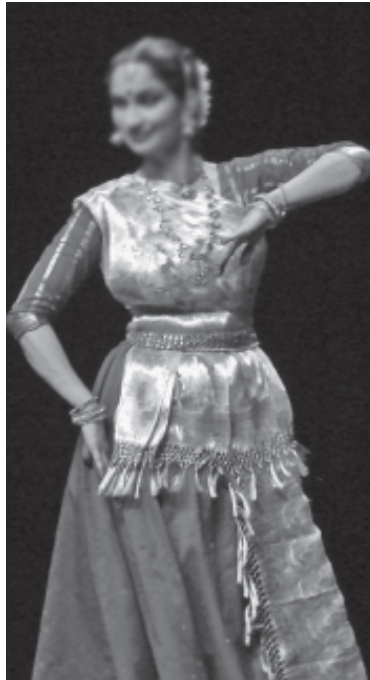
Figure 11.6 Kathak