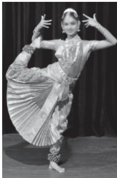
Figure 11.5 BharataNatyam

In earlier days it was known as ‘Daasiyattam’ since it was performed by the the Devadasies in temples of Tamil Nadu. The Bharatanatyam was derived from three basic concepts of Bhava, Raga, and Thaala. The music used during the performance is based on Carnatic classical music. Mridangam, veena, flute, and violin are main musical instruments, used during dance performance.