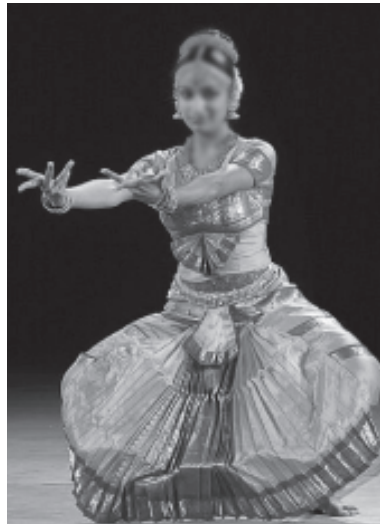
Figure 11.8 Kuchipudi

This dance originated from Andhra Pradesh. It was initially performed in the temples by the Brahmin men, known as Bhagavathalu. It is a form of dance-drama, enacted at night in the open air on an improvised stage. The dancers wear colourful costumes, make-up, and heavy jewellery and ornaments. During the dance performance classical Carnatic music is used. Mridangam, violin, and clarinet are the major musical instruments used during the performance.