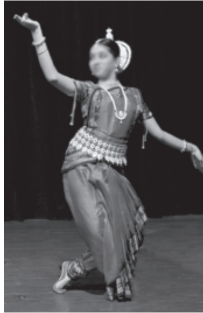
Figure 11.11 Odissi