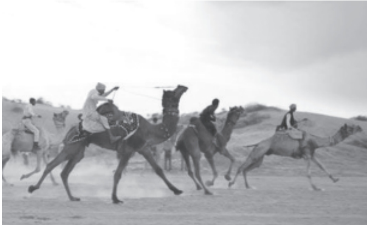
Figure 11.4 Camel Fair