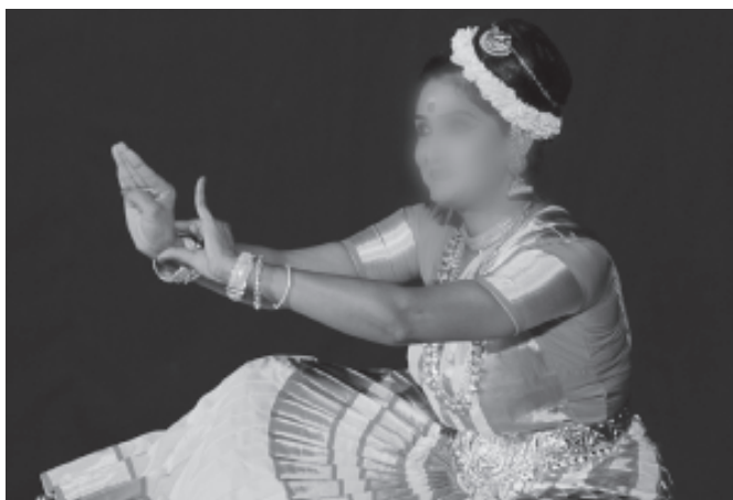
Figure 11.10 A Mohiniyattam

This dance form belongs to Kerala. Mohiniattam means Mohini's Dance (according to Indian mythology, Mohini was incarnation of Lord Vishnu in the form of a beautiful woman with the intention to slay the demon Bhasmasur).