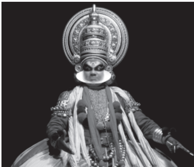
Figure 11.7 A Kathakali

This is a unique form of dance drama from Kerala, which is performed on stories from the Hindu epics like the Ramayana, the Mahabharata, and the Purans in the temples.