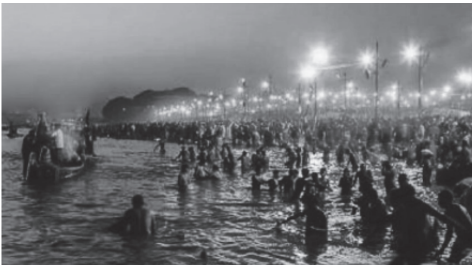
Figure 11.3 Kumbh Mela