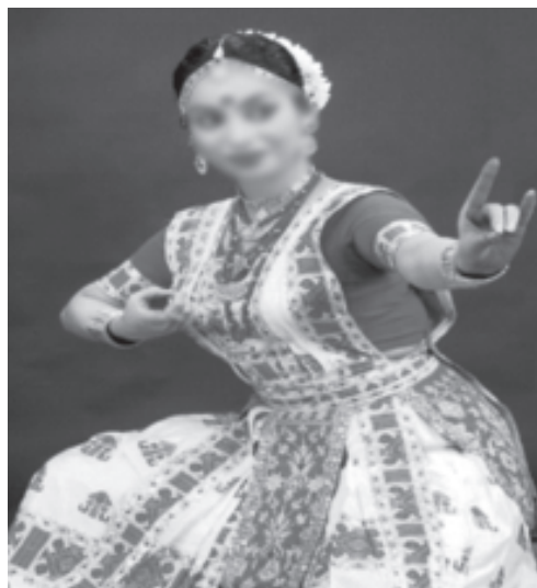
Figure 11.12 Sattriya dance

It is the classical dance form of Assam. It was introduced by the great Vaishnav saint and reformer of Assam, Mahapurusha Shankaradeva. Sattriya dance tradition is governed by strictly laid down principles in respect of hastamudras, footwork, aharyas and music etc. The costumes of the dancer are made of Assam Pat Silk and traditional Assamese jewellery. It is accompanied by musical compositions called borgets based on classical ragas.