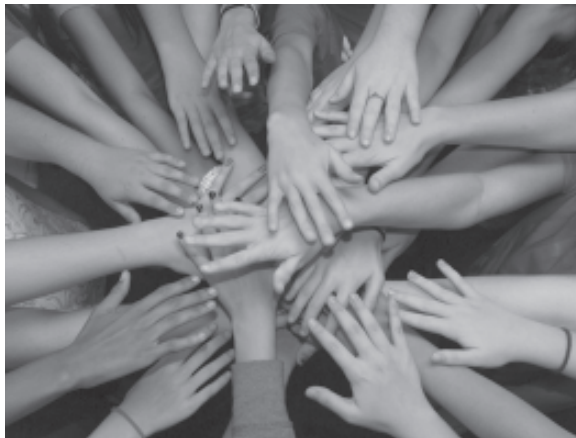
Fig. 18.3: Team

Any formal activity intended to improve the development and functioning of a work team is referred to as team building. Team building is an effort in which a team studies its own process of working together and acts to create an environment that encourages and values the contributions of team members. Team building helps to reshape norms and strengthen cohesiveness. Team building becomes necessary when the team start leaving the team or lose focus on their effective roles and team objectives.