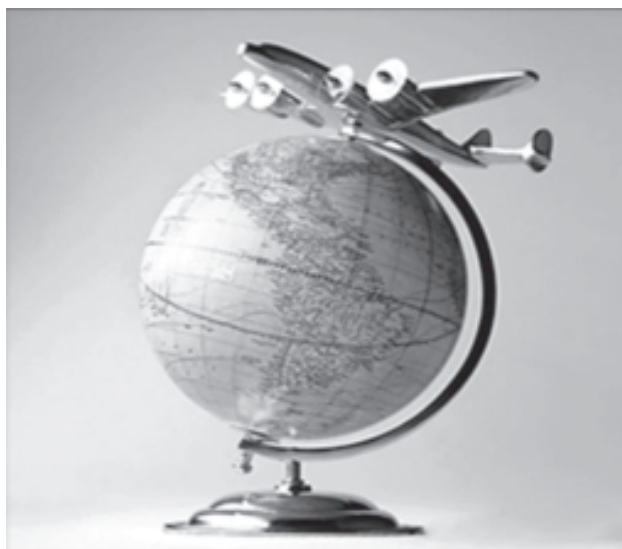
Fig. 2.4: Air transport

Airways: Airways is very important for foreign tourists as many of the countries are not linked with rail or road transport. It is the fastest means of transport but it is costly. Many of the countries are connected by air and it reduces the distance. Air transport has accelerated tourism in a big way, particularly the international tourism.