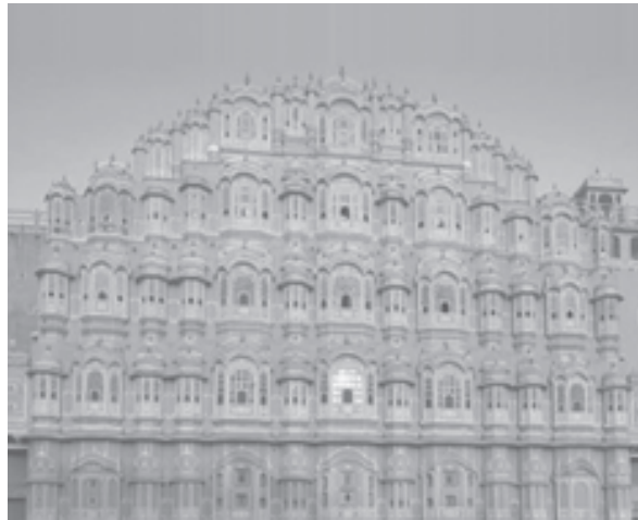
Fig. 2.9: Hawa Mahal Jaipur