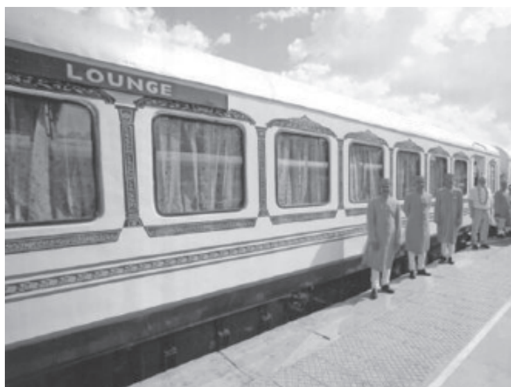
Fig. 2.8: Palace on wheels

The Rajasthan Tourism Development Corporation (RTDC) is a Private Limited Company under the Indian Companies Act 1956. It started in 1978 and has become the pioneering Corporation in budget lodging which is considered as a trademark in the travel industry. RTDC knows it very well that commitment to achieving quality, culture of customer service, a warm and cordial reception to the guests, are the key to hospitality and the secret of success in the tourism industry. RTDC gives us the opportunity to experience the charm of the most exotic destinations of Rajasthan like historical forts, palaces, art and culture. Endowed with natural beauty in bounty and great history, Rajasthan has a flourishing tourism industry. Every third foreign tourist visiting India travels to Rajasthan as it is a part of the Golden Triangle about which you will read later in this course.