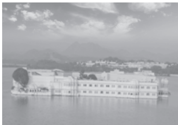
Fig. 2.11: City Palace Udaipur