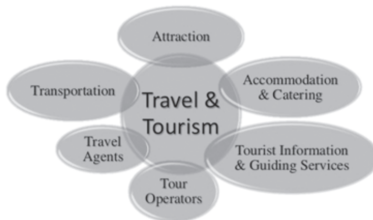
Fig. 2.2: Components of tourism industry