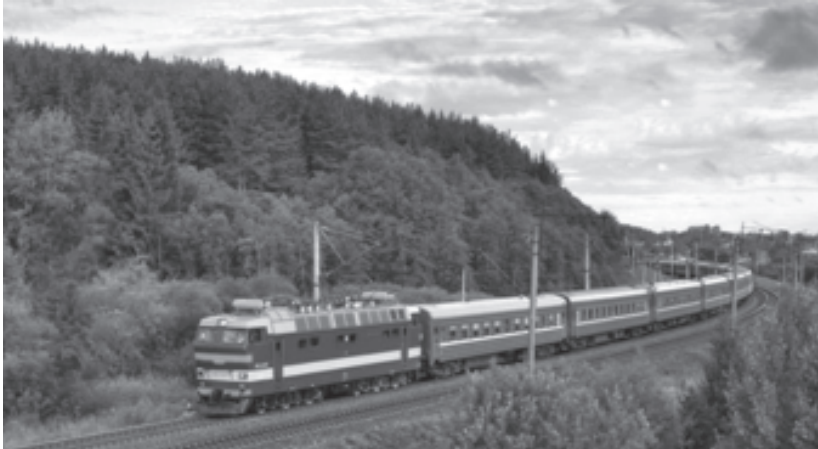
Fig. 2.3: Rail transport