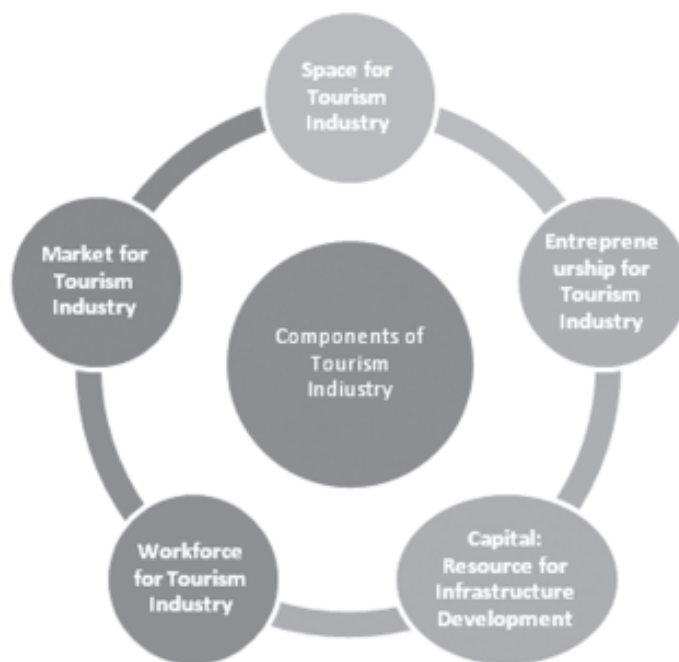
Fig. 2.1: Components of tourism industry