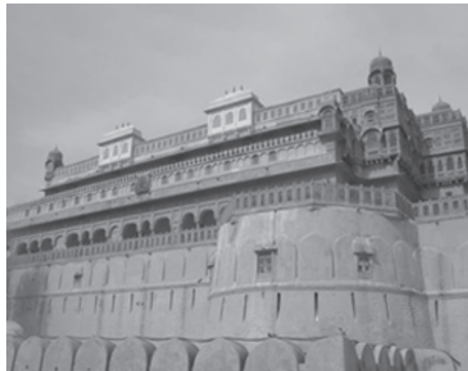
Fig. 2.13: Mehrangarh Fort, Jodhpur