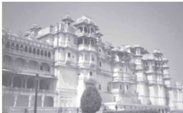
Fig. 2.10: Lake Palace Udaipur