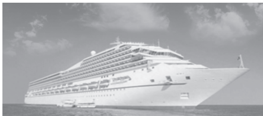
Fig. 2.6: Water transport

Waterways: Waterways include ferry, cruise, water taxis and other forms of water transport. They may be of the open seas or inland transport as well. Water transport was very popular before the advent of motorised vehicles. In the olden days, the water was considered an important means of transport. Because of the increased importance of road, rail and air, the services of water transport taken by passengers has gone down drastically. The details of the water transport can be seen in the following source.