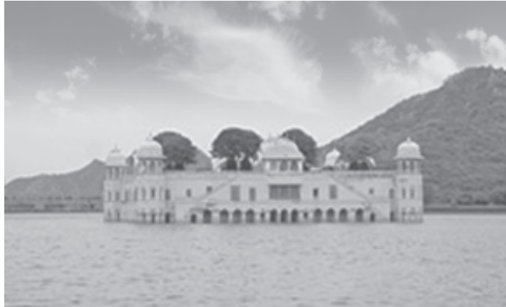
Fig. 2.12: Jal Mahal Jaipur