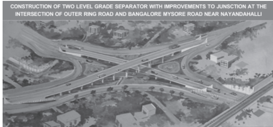
Fig. 2.5: Road transport