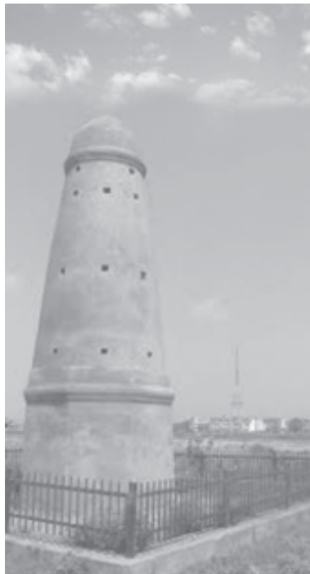
Fig. 5.1: Kos Minar

Those days travellers generally travelled on foot. When emperor Jahangir (1605-1627 AD) noticed some walls measuring 2\frac{1}{2} to 3 gaz long along the roads in Gujarat, he realised how handy they were to the porter who was tired and wanted to rest. He could easily place the luggage on the wall and left it again with ease