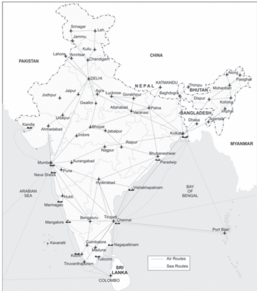
Fig. 5.4: Air and Sea Routes in India

Water transport is also used for tourism promotion as West Bengal Tourism Department introduced special tourist programmes to carry tourists to Sunderbans. Goa Tourism Department organises sea cruises for half or full day booking for tourists. Tourists enjoy a lot cruising on the Ganga, Brahmaputra and Hoogly