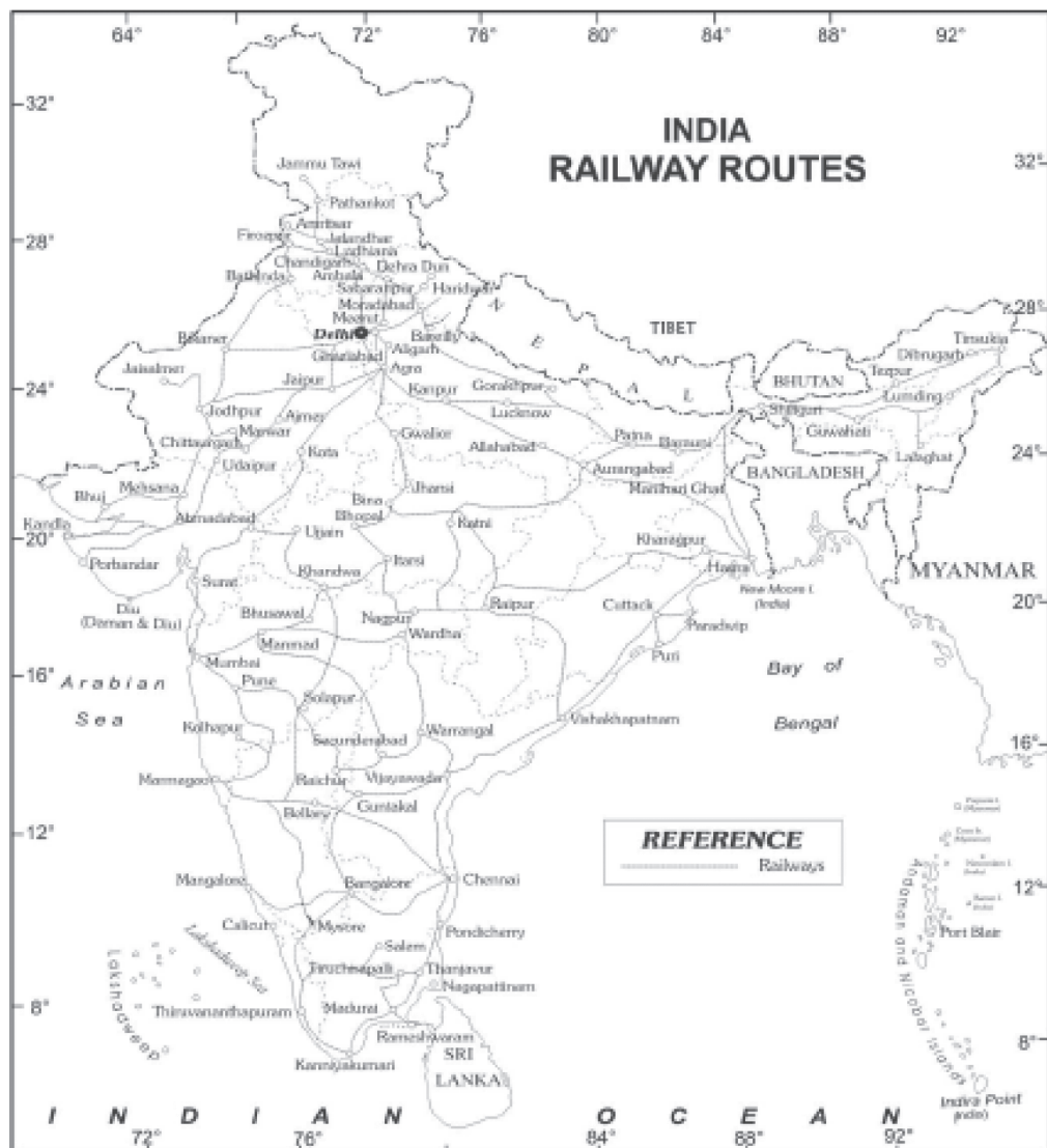
Fig. 5.3: Railways in India