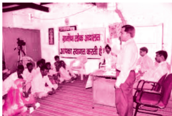
Figure 16.1: Lok Adalat

‘Lok Adalat’ is a system of conciliation or negotiation. It is also known as ‘people’s court’. It can be understood as a court involving the people who are directly or indirectly affected by the dispute or grievance. ‘Lok Adalat’, established by the government settles dispute through conciliation and compromise. The First ‘Lok Adalat’ was held in Chennai in 1986. ‘Lok Adalat’ accepts the cases which could be settled by conciliation and compromise and pending in the regular courts within their jurisdiction.