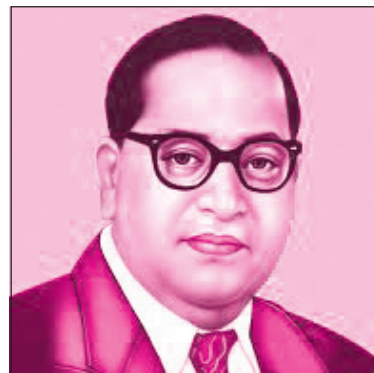
Figure 18.2 Dr. B.R. Ambedkar Chairman of Drafting Committee of Constitution