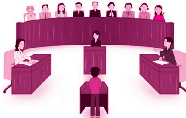
Figure 2.1: Court

We will discuss these features again with respect to 'Common Legal System'.