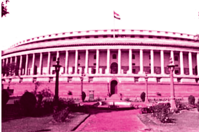
Figure 13.2 : Parliament of India

organs which might violate the Constitution, structure and powers assigned to them. Only Judiciary has the powers of interpreting the Constitution and its mandates, and the say of judiciary has to be followed by all organs.