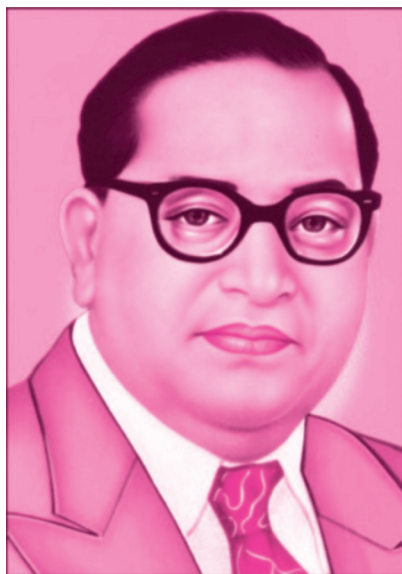
Figure 13.1: Dr. B. R. Ambedkar Chairman Drafting Committee

The Unitary Judicial System seems to have been accepted with the least questioning. The Supreme Court was to have a special, countrywide responsibility for the protection of individual rights. Dr B. R. Ambedkar was perhaps the greatest apostle in the Assembly of what he described as 'one single integrated judiciary having jurisdiction and providing remedies in all cases arising under the Constitutional law, the Civil, or the Criminal law, essential to maintain the unity of the country'.