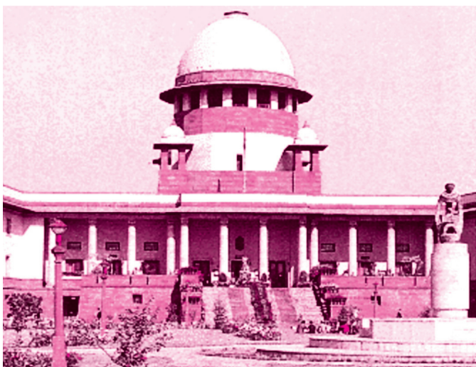
Figure 13.3 : Supreme Court of India

Indian judiciary is a single integrated and unified system of Courts for the Union as well as the States, which administers both the Union and State laws, and at the head of the entire system stands the Supreme Court of India. The development of the judicial system can be traced to the growth of Modern–Nation–States and constitutionalism.