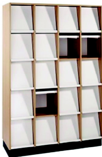
Fig.15.4: A Periodical Display Rack