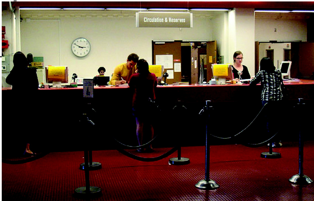
Fig.15. 3: A Circulation Counter