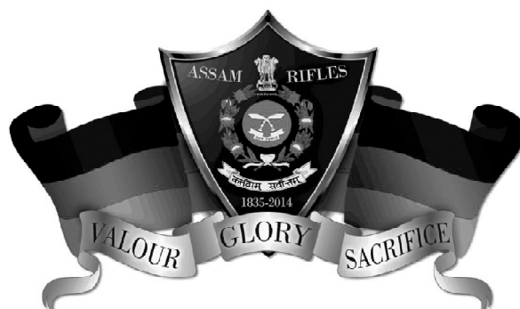
Fig.18.2 Assam Rifles Logo

The Force is a potent organization with 46 battalions and its associated command and administrative back up. It is designated by the GoM committee as the Border Guarding Force for the Indo - Myanmar border and is also its lead intelligence agency. Look at the logo of the Assam Rifles given below.