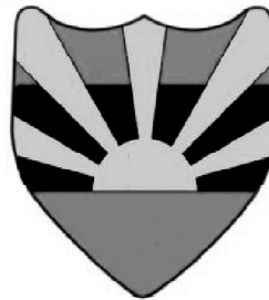
Fig 4.2 : Eastern Command (Headquarters - Kolkata)