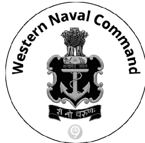
Fig 4.9 : Western Naval Command with headquarters at Mumbai

The Indian Navy is divided into three commands