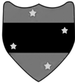
Fig 4.4 : Southern Command (Headquarters - Pune)