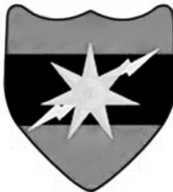
Fig 4.5 : South-Western Command (Headquarters - Jaipur)