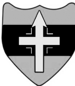
Fig 4.3 : Northern Command (Headquarters - Udhampur)