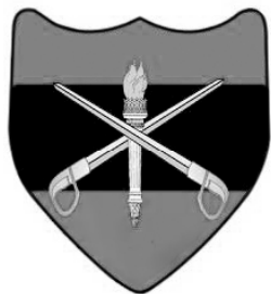
Fig 4.6 : Training Command (Headquarters - Shimla) - It is the only non operational command as it has all service training institute under it.