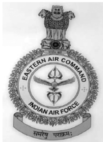
Fig 4.13 : Eastern Air Command HQ Shillong, Meghalaya