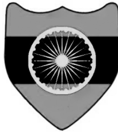
Fig 4.1 : Western Command (Headquarters - Chandimandir)

The Indian Army is organised into 7 commands with 6 operational commands and one training command. These are Western Command, Eastern Command, Northern Command, Southern Command, South Western Command, Training Command, Central Command.