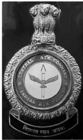
Fig 4.12 : Central Air Command - HQ Allahabad, Uttar Pradesh