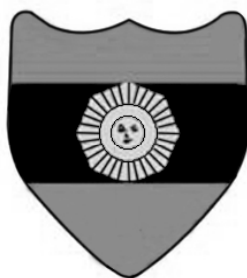
Fig 4.7 : Central Command (Headquarters - Lucknow)

Each Command is headed by a General Officer Commanding in Chief (GOC-in-C). His rank is Lieutenant General.