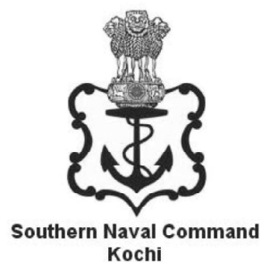
Fig 4.11 : Southern Naval Command with headquarters at Kochi.

Each Naval Command is headed by a Flag Officer Commanding in chief (FOC-in-C). His rank is Vice Admiral.