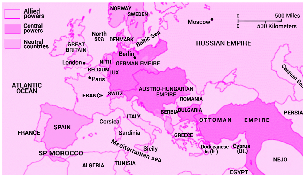
Map 12.1 The spread of world war-I

The other reason was that countries were entering into secret alliances (alliances means tractics between countries to help each other militaries) based on the personal ambitions of the political leaders. Such secret alliances further contributed to suspicions about the activities of the other country. Although many reasons contributed, the immediate cause as noted above was the Sarajevo incident in which the Crown Prince of Austria-Hungary, Archduke Franz Ferdinand was assassinated along with his wife on 28 June 1914 in Sarajevo. Where was the war fought? See the map (Map 12.1) below to understand the countries where this war took place.